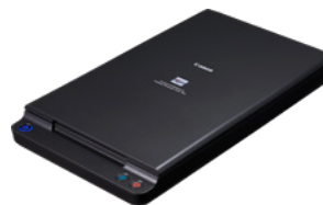
A4 Flatbed Scanner Unit 102

Scan bound books, journals and fragile media by adding the Flatbed Scanner Unit 102 for documents up to A4 or Flatbed Scanner Unit 201 for A3 scanning. Connected by USB, these flatbed scanners work seamlessly with the DR-C225 II (only) in a smooth dual-scanning operation that lets you apply the same image-enhancement features to any scan.